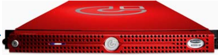
Cast Iron Integration Appliance

Cast Iron Integration Appliances enable IT Departments to be nimble and responsive to the needs of the business. These Integration Appliances have been specifically engineered for salesforce.com customers and contain everything needed to complete their integration projects within days.